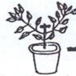
Denotes cutting stopped.