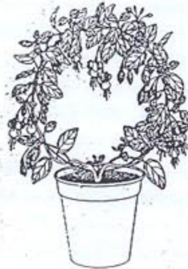
A ring-shaped fuchsia